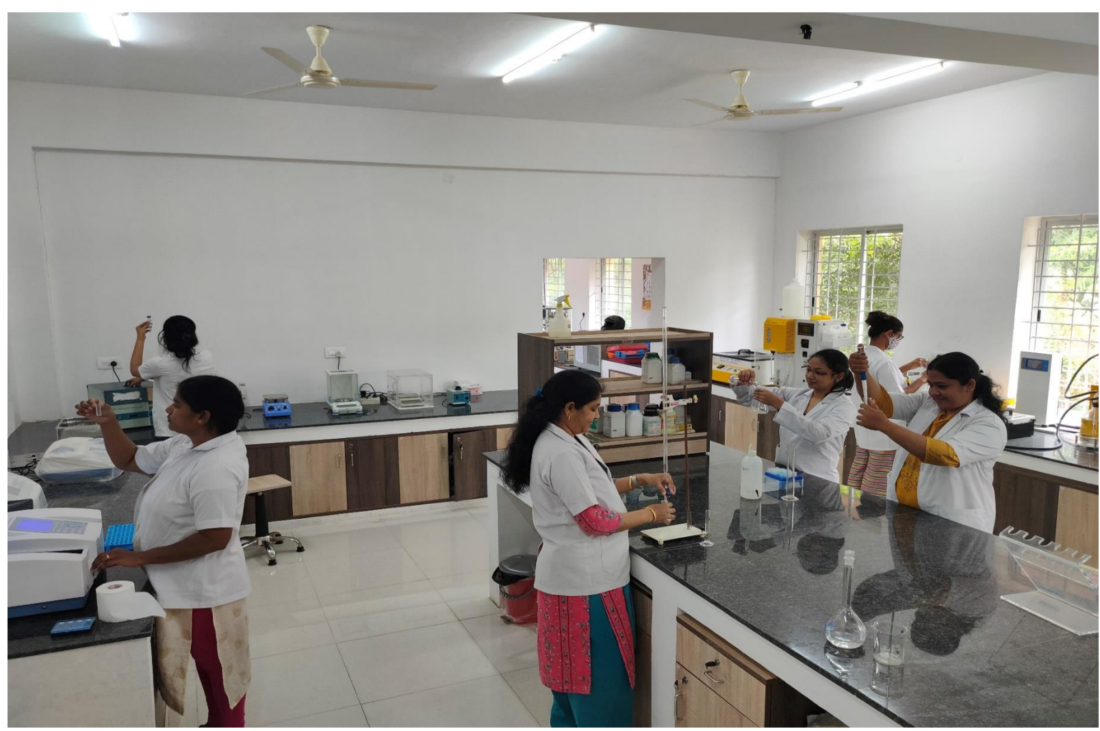
Analytical Research Lab