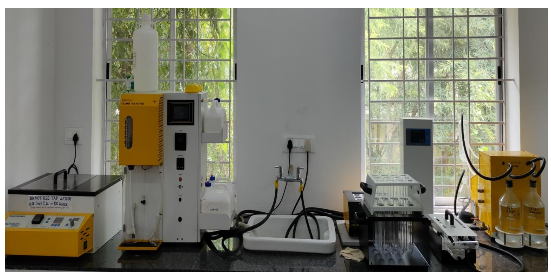
Automated Protein Analyzer