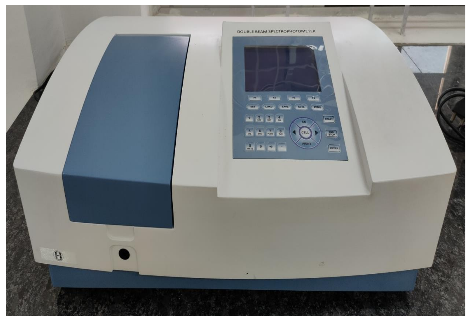
Double Beam UV Spectrophotometer