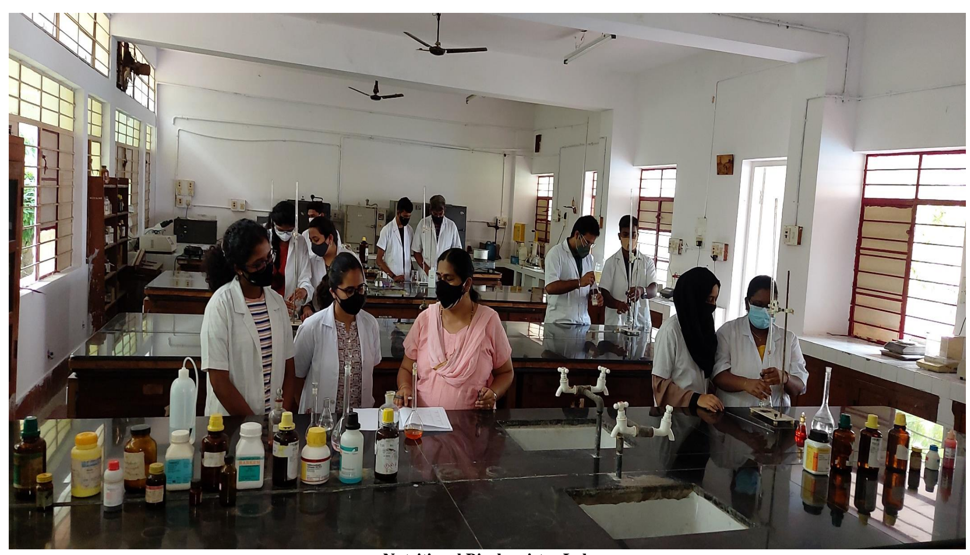
Nutritional Biochemistry Lab