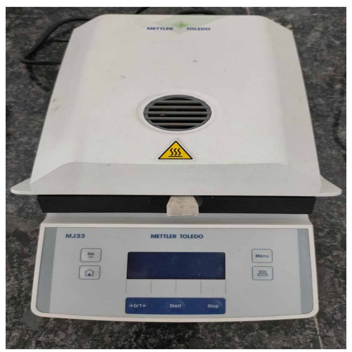
Automated Moisture Analyzer