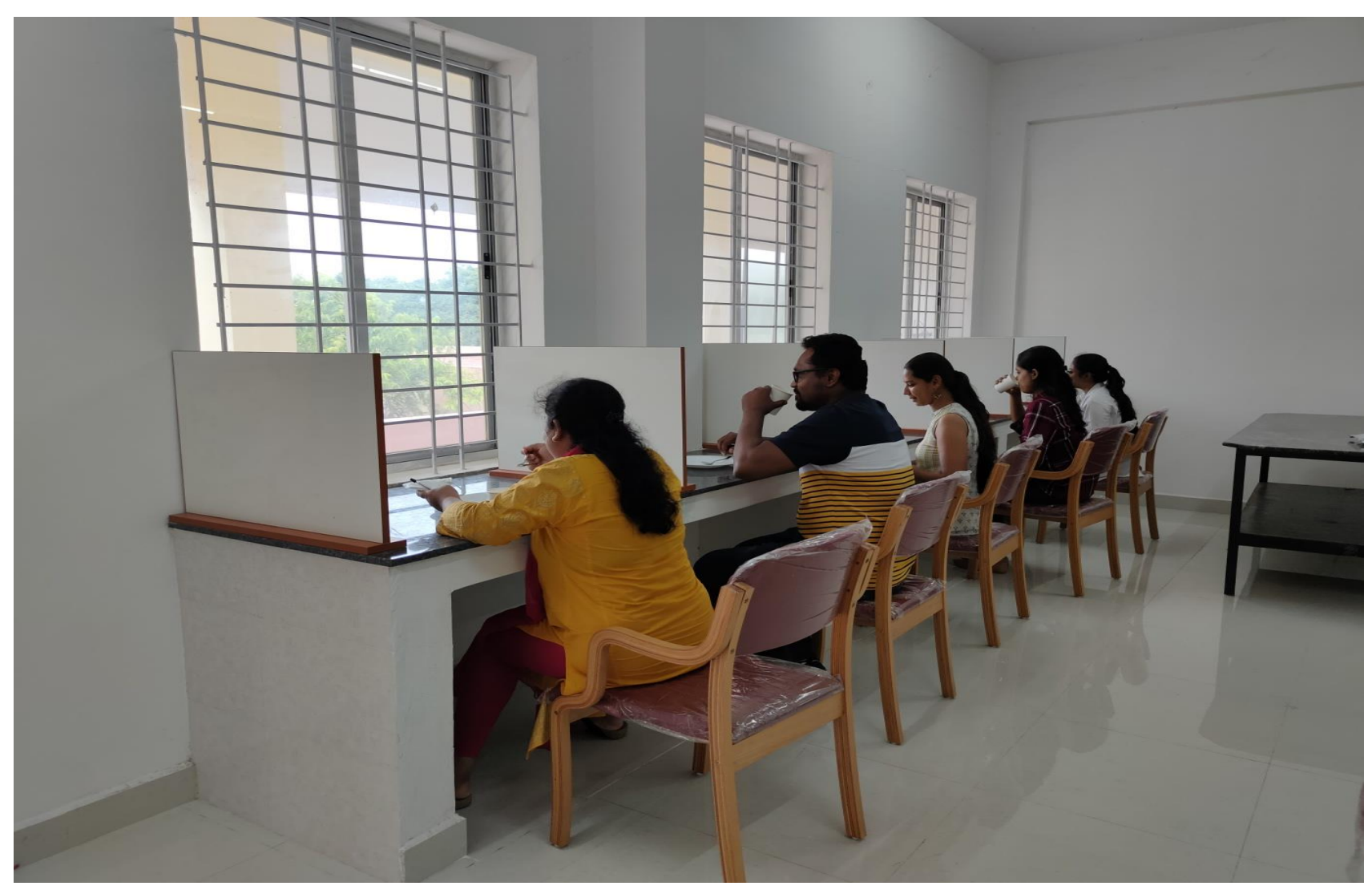
Sensory Evaluation Booths