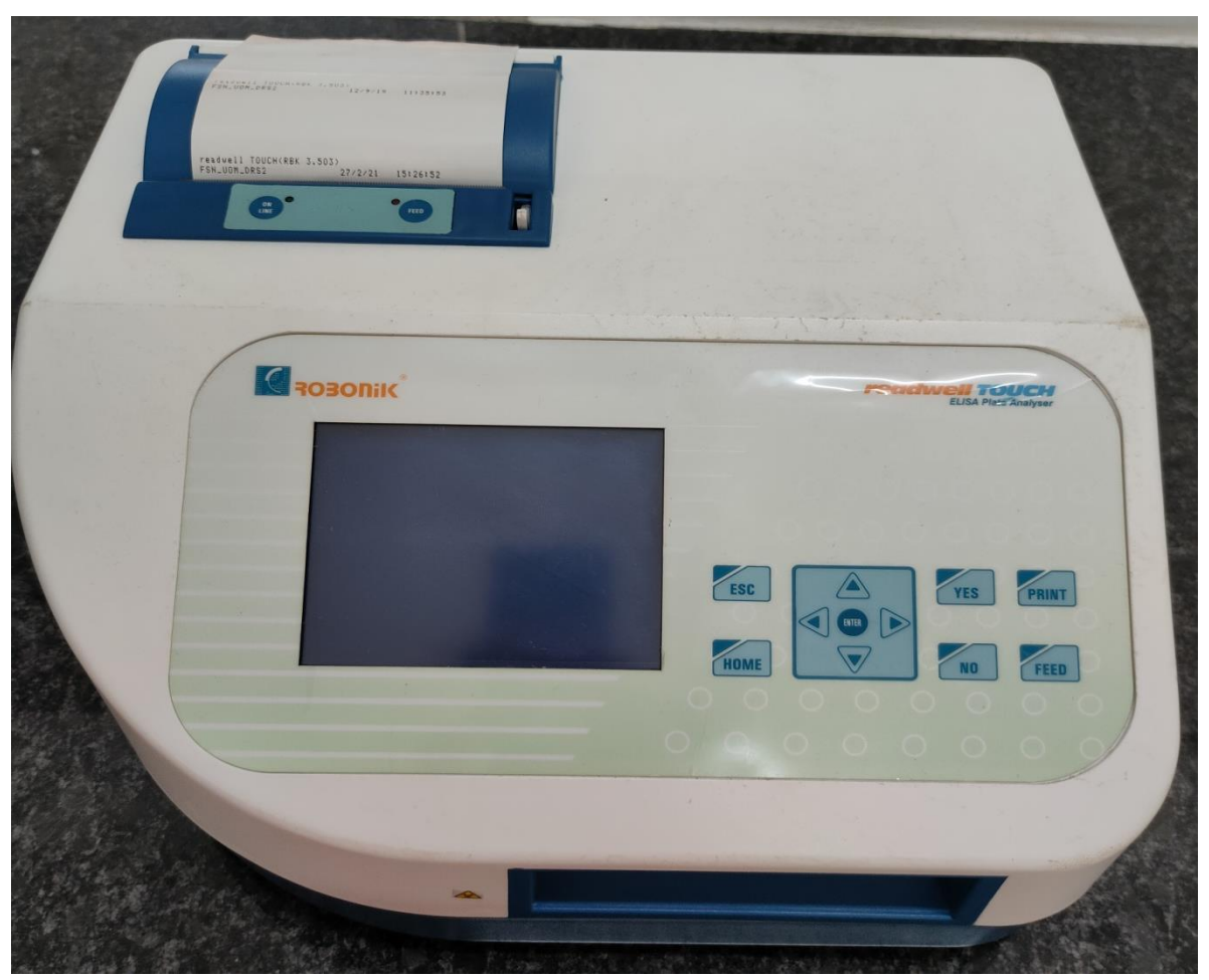
ELISA Plate Analyzer